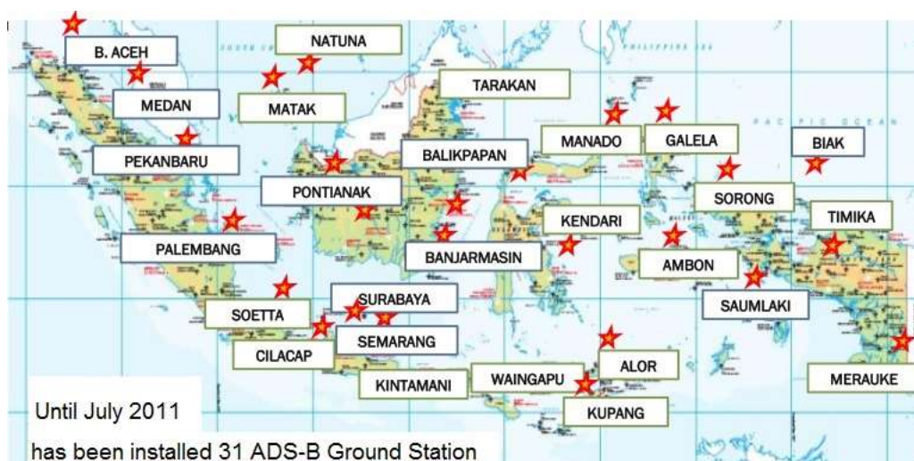
Figure 2: Indonesia ADS-B Ground Stations July 2011

2.2 The program of installing and implementing ADS-B had been starting since 2006 and will fully implement in 2015, the steps of implementation as follows, as per AIP Supplement No. 10/14 date 24 JUL 2014 with effective date of 18 SEP 2014: